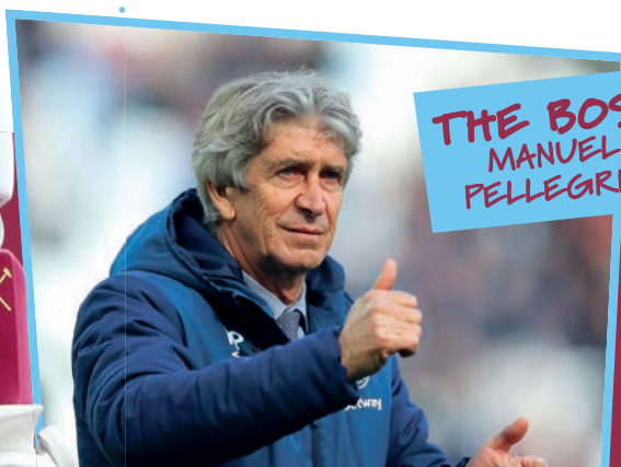
THE BOSS MANUEL PELLEGRINI