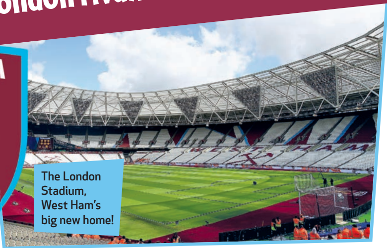
The London Stadium, West Ham's big new home!

Hurst and Martin Peters were back at Wembley, this time to win the World Cup with England on home turf!