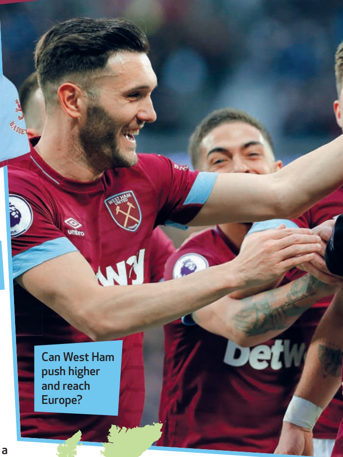
Can West Ham push higher and reach Europe?

Moving home is stressful for anyone – especially when the place you’re leaving behind is full of memories! It’s been a funny three years for West Ham fans after they left Upton Park in 2016, but after a summer freshening up their squad, a good 2019-20 could make the London Stadium really feel like home.