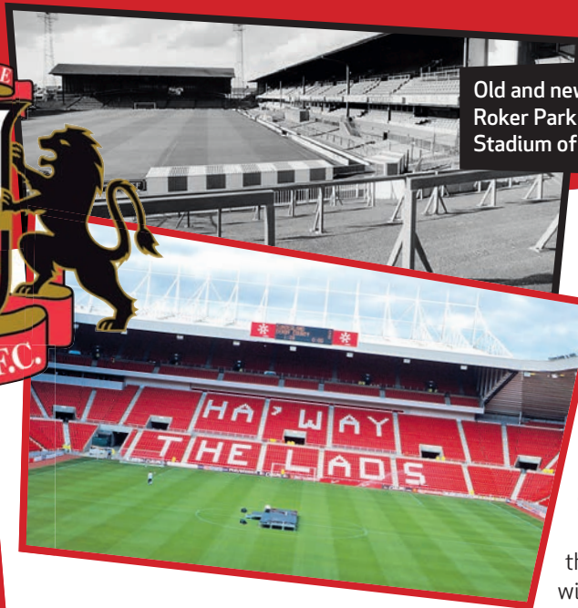
Old and new: Roker Park and the Stadium of Light