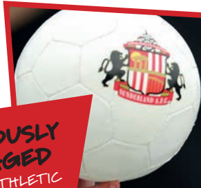
PREVIOUSLY MANAGED ALLOA ATHLETIC ST MIRREN