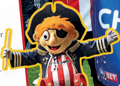
MASCOT CAPTAIN BLADE