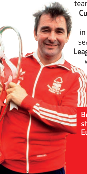
Brian Clough shows off the European Cup

Forest were relegated in 1993, Clough's final season, and dropped to League One in 2005. They won promotion in 2008 and have been in the Championship ever since.