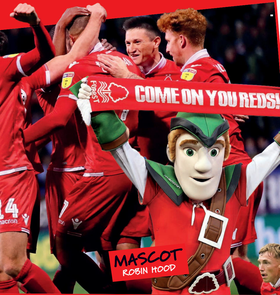
MASCOT ROBIN HOOD