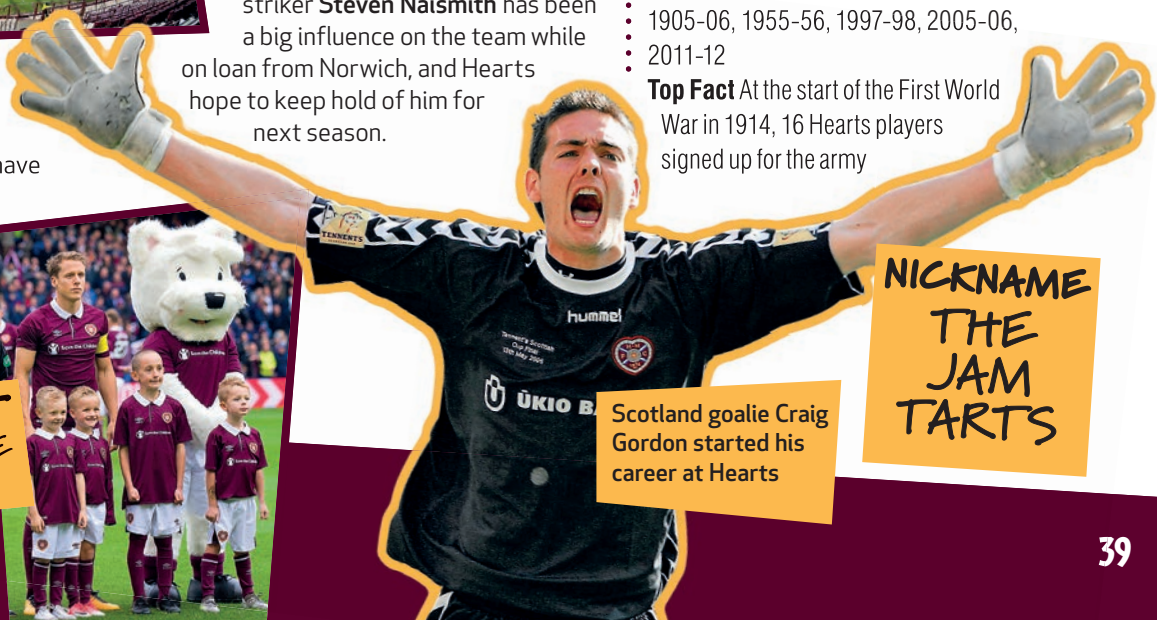
Scotland goalie Craig Gordon started his career at Hearts