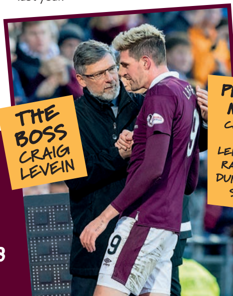
THE BOSS CRAIG LEVEIN

Craig Levein was a popular central defender for Hearts in the 1980s and 1990s. He also played for Scotland in the 1990 World Cup and was later the national team manager . Levein became Hearts manager for the first time in 2000 and stayed for four years. He returned to the club in 2014 as director of football and became manager again last year.