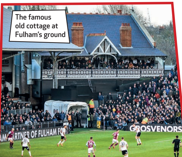
The famous old cottage at Fulham's ground

Fulham have also got to a European final – the Europa League in 2010. They beat Italian giants Juventus 5-4 on aggregate along the way. Unfortunately, the final ended in defeat: Fulham lost 2-1 to Atlético Madrid , whose players included current Man City star Sergio Agüero and Man Utd keeper David de Gea. Atlético got their winning goal late in extra time.