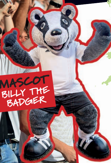
MASCOT BILLY THE BADGER