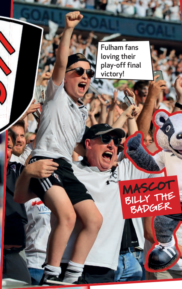
Fulham fans loving their play-off final victory!