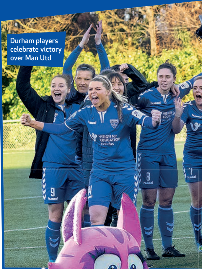
Durham players celebrate victory over Man Utd

As the only club in the current Women's Super League and Championship not connected to a men's team, Durham don't have much money to spend on players. That makes it impressive that they've competed in the Championship in each of their six seasons so far, because while football