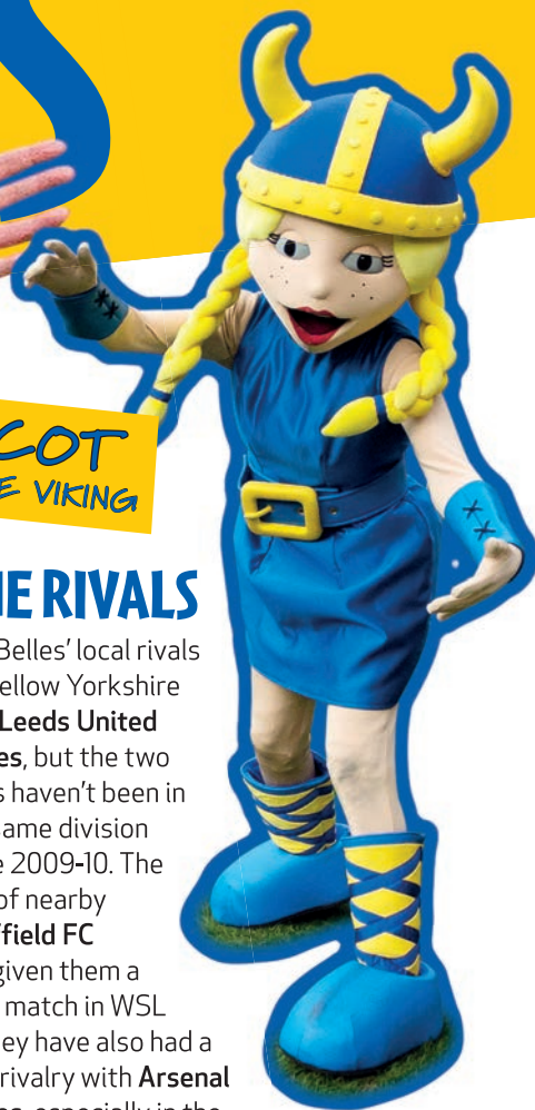
MASCOT VALDA THE VIKING