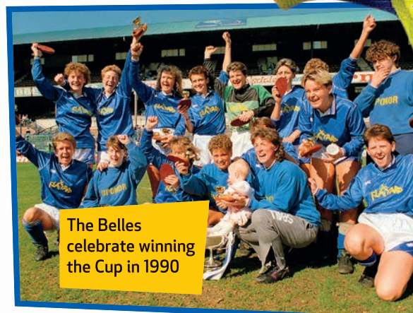
The Belles celebrate winning the Cup in 1990

The Belle Vue Belles (later changed to Doncaster Belles) soon proved themselves, winning the FA Women's Cup in 1983, 1987, 1988 and 1990. A new National Premier Division started in 1991-92, and the Belles became its first champions , winning all 14 of their matches. They also won the FA Women's Cup (again!) that season – a trophy double they repeated two years later.