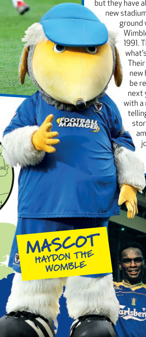
MASCOT HAYDON THE WOMBLE