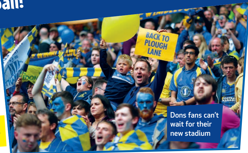
Dons fans can't wait for their new stadium

work hard to keep it. The Dons were ten points adrift of safety in February but went on an amazing run, losing just two of their 15 remaining games to stay up on goal difference. This club never give up!