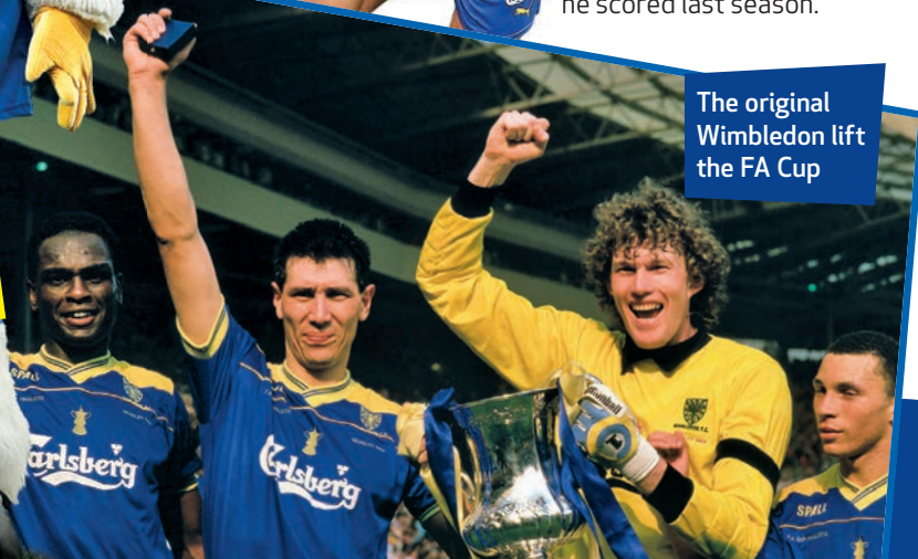
The original Wimbledon lift the FA Cup