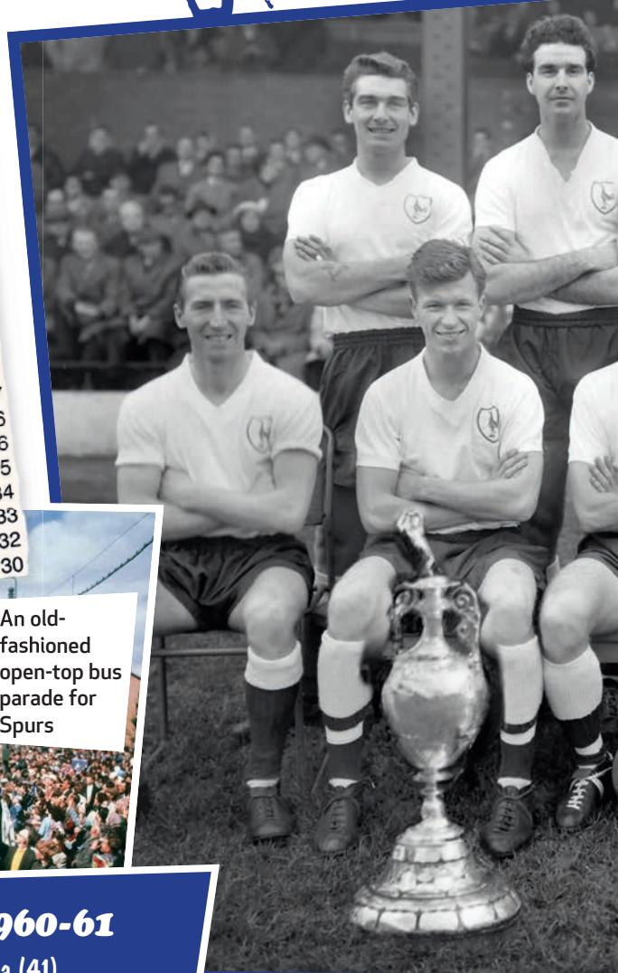
An old-fashioned open-top bus parade for Spurs