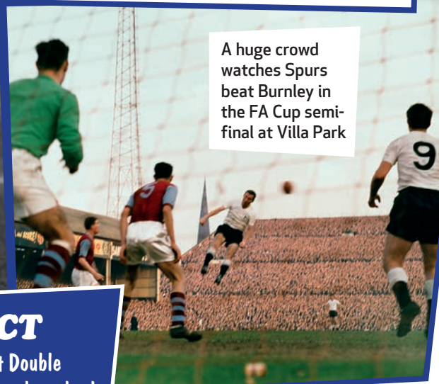
A huge crowd watches Spurs beat Burnley in the FA Cup semi-final at Villa Park

Spurs made a good attempt at defending their title, finishing third, four points behind surprise champions Ipswich (who had been promoted from Division Two in 1960-61). They also won the FA Cup again, this time beating Burnley 3-1. In the European Cup Spurs reached the semi-final before losing to the eventual champions, Benfica of Portugal.