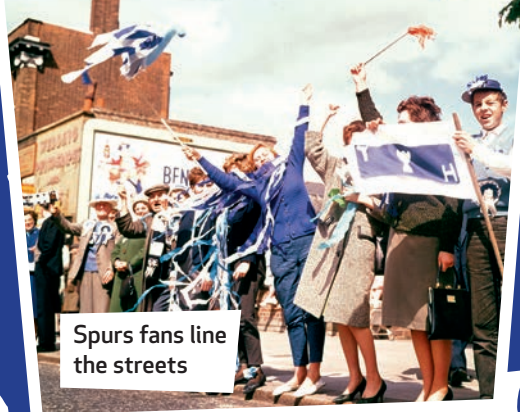
Spurs fans line the streets