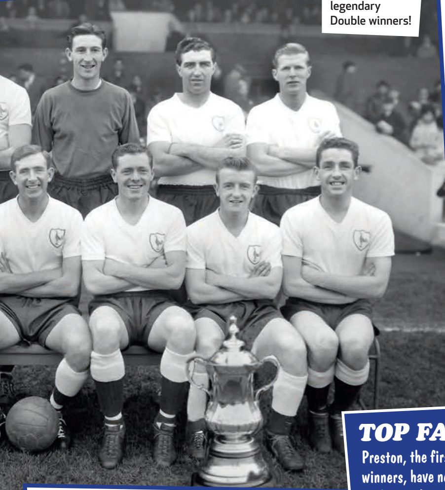
Tottenham's legendary Double winners!