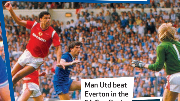
Man Utd beat Everton in the FA Cup final

Everton added more firepower for 1985-86 by buying England ace Gary Lineker from Leicester. Although he scored 30 goals the team failed to win anything. They lost the FA Cup final again, this time to Liverpool who also won the League and Cup double with Everton finishing second.