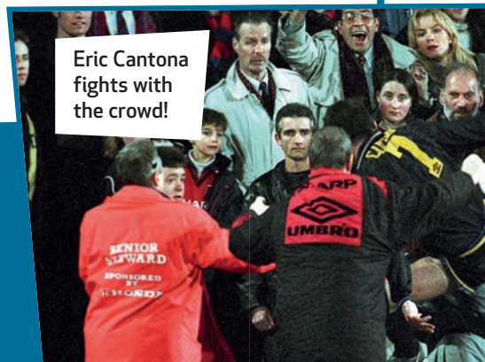
Eric Cantona fights with the crowd!