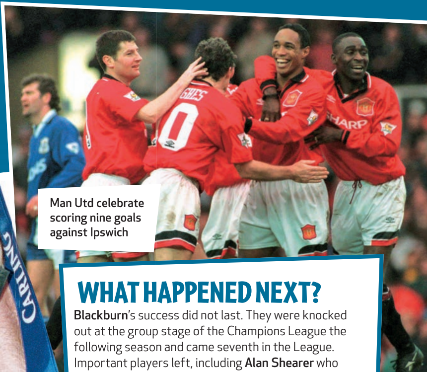
Man Utd celebrate scoring nine goals against Ipswich