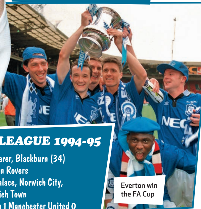
Everton win the FA Cup

Blackburn are the only League team that play in blue and white halved shirts. They have worn their famous kit since becoming one of the founder members of the Football League in 1888!