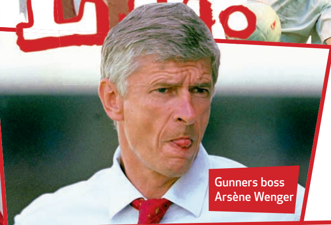
Gunners boss Arsène Wenger