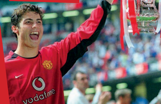
Cristiano Ronaldo and Ruud van Nistelrooy lift the FA Cup!

This was Charlton's highest League finish in 51 years – but they were relegated three years later.