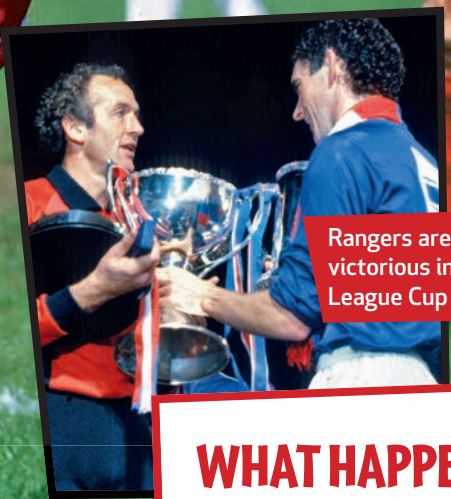
Rangers are victorious in the League Cup