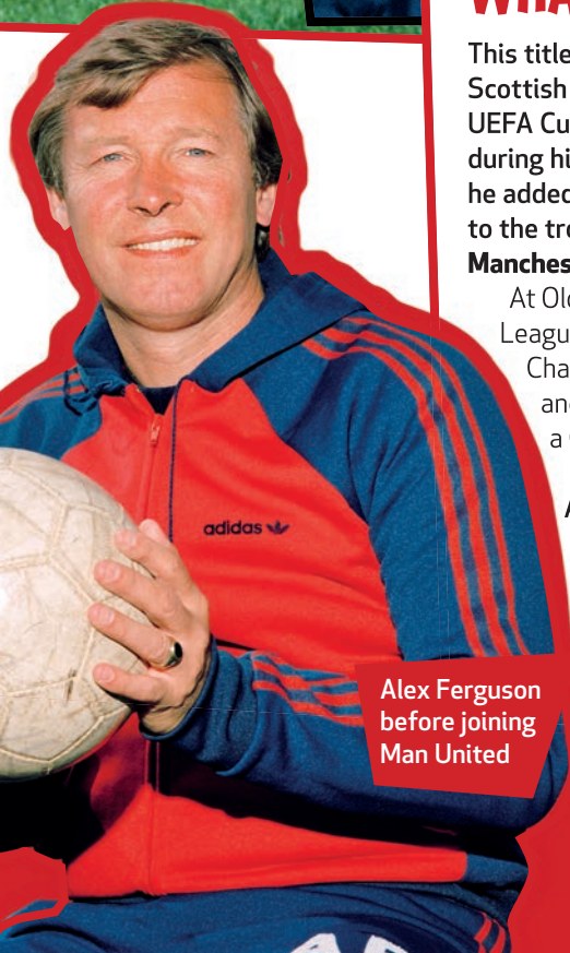
Alex Ferguson before joining Man United