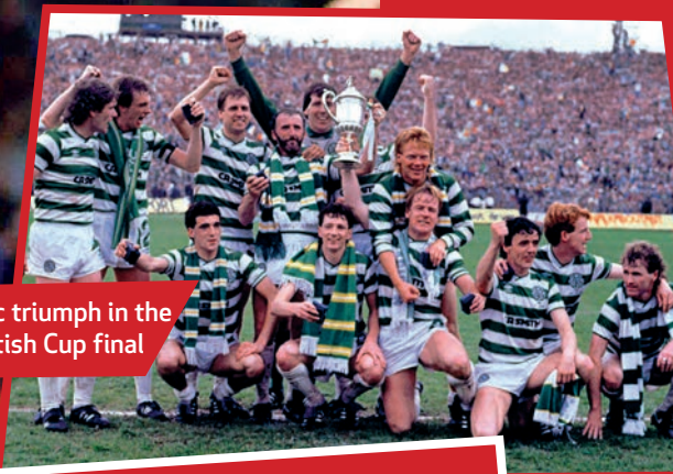
Celtic triumph in the Scottish Cup final